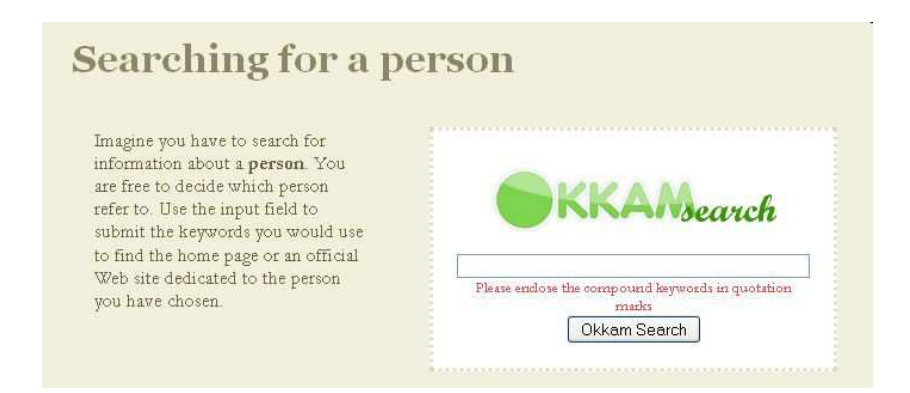
Fig. 1. Screenshot of the Search Interface used in the experiment.

To receive more complete queries from the participants, in half of the tasks they received (after having submitted the query using the proper field) a request to refine the query. The other tasks were "one-shot", i.e. the refinement was not requested.